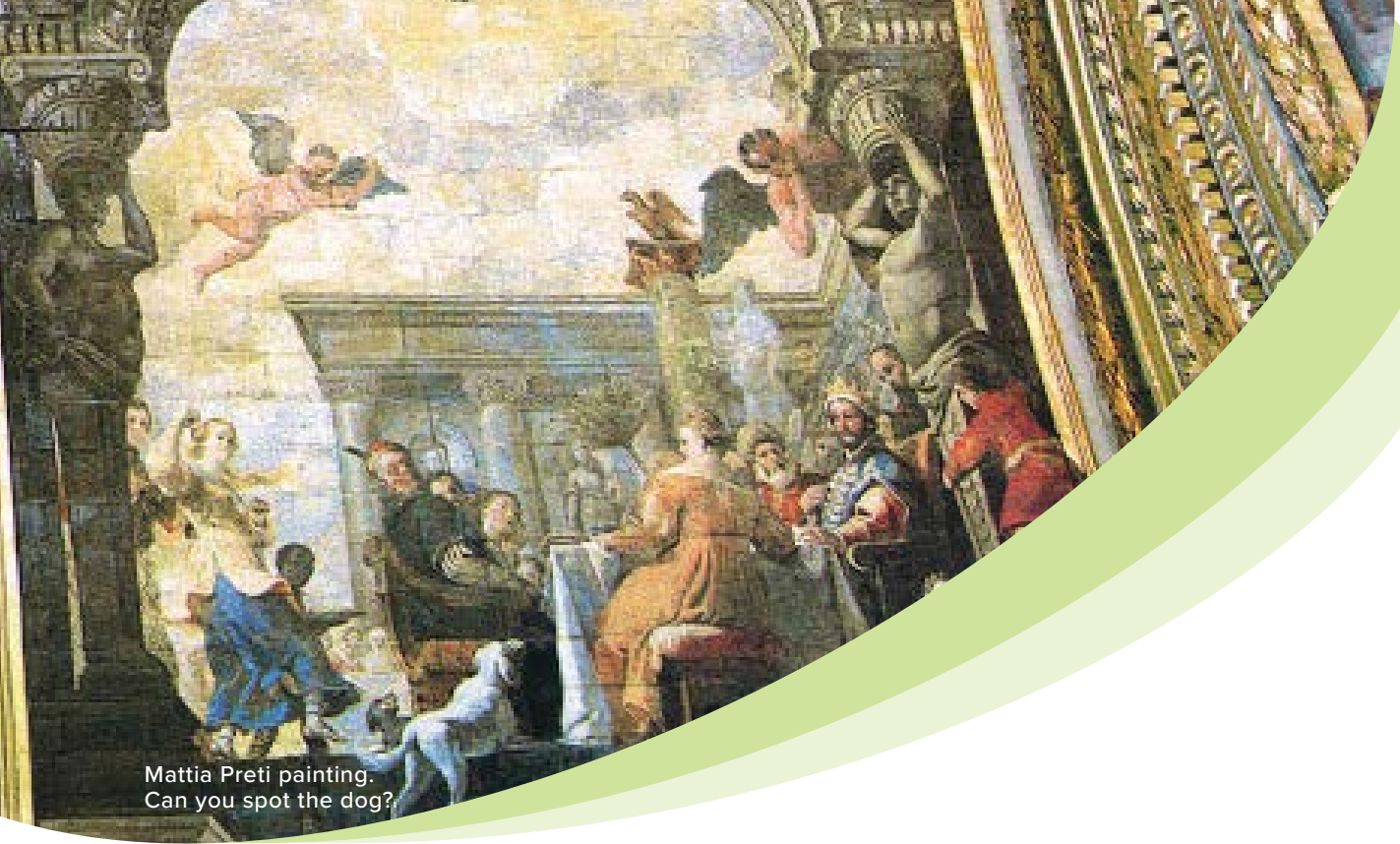
Mattia Preti painting. Can you spot the dog?