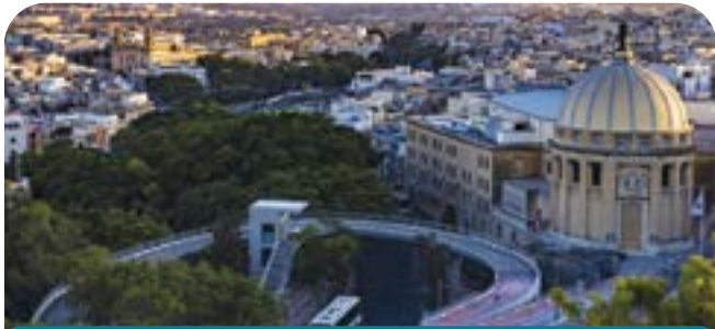
Aerial view showing construction of recent flyover at the Blata l-Bajda site.