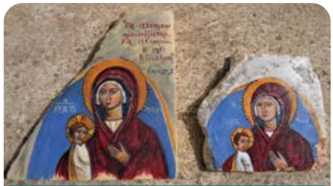
Our Lady on stone is Our Lady of Mellieha, Malta. Quote taken from Psalm 22.5 ‘To you they cried out and were saved; in you they trusted and were not put to shame’.