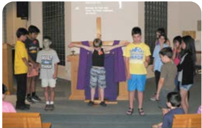
Children prayerfully display the Stations of the Cross during Holy Week.