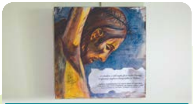
The crucifix inspired by the Vigil Pope Francis held in empty St Peter’s square: my painting written on Good Friday.