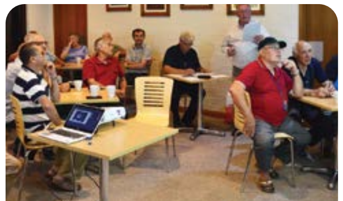
A games night 'Recalling SDC History'.