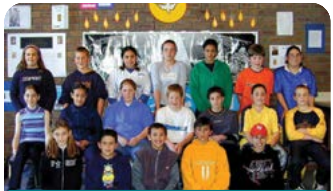
Confirmation class line up for a photo at Preca Centre, Altona Meadows in 2002. These young people would be near to thirty years of age now. Joy indeed knowing that we have been instrumental in initiating them into the life of the Church.