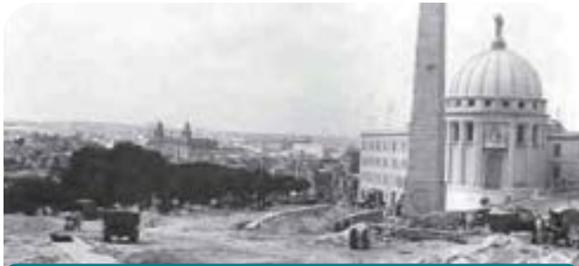
Early photo of the General House.