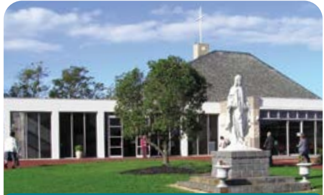
Queen of Peace church, Altona Meadows.

John Paul II, Christifideles Laici, Post-Synodal Apostolic Exhortation, 1988, n. 26.