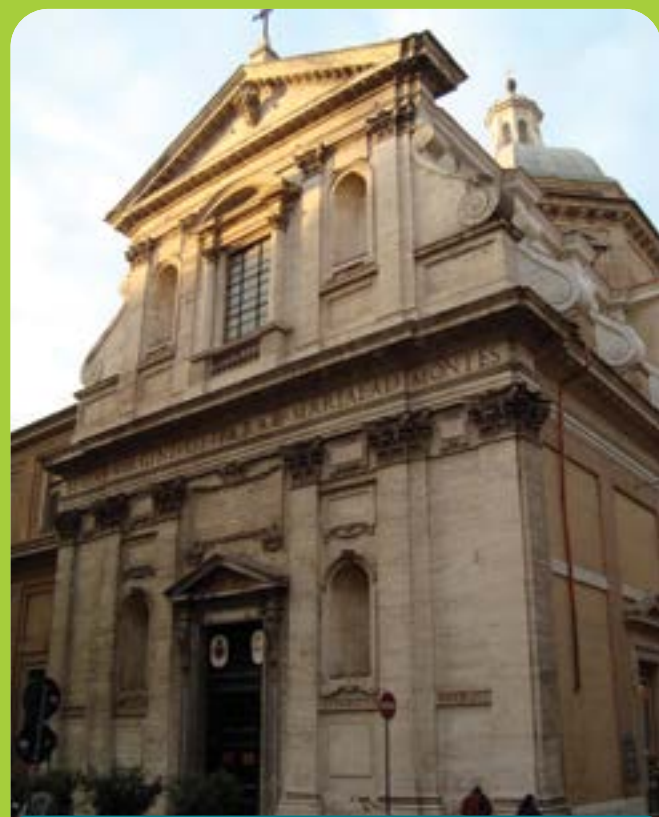
S. Maria ai Monti in Rome.

He travelled as a pilgrim on foot, all over Europe. Finally he settled in Rome, living in the Colosseum, visiting churches, especially where the Eucharist was exposed during the Forty Hours