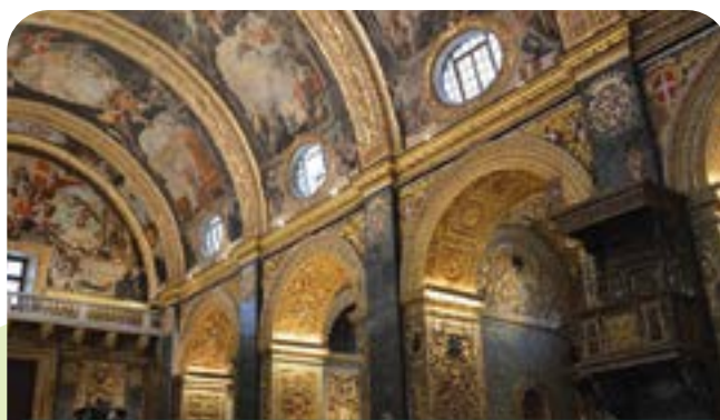
Mattia Preti painting.