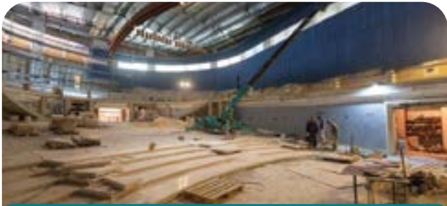
The mammoth task ahead.