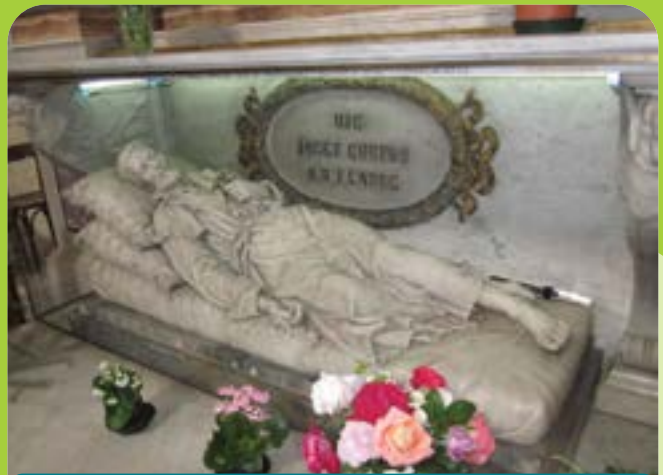
Burial place of St Benedict Joseph Labré.