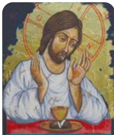
Icon depicting Breaking of Bread.

This was especially deeply felt when my sister brought her son and all I could do was stand in the doorway while they remained in their