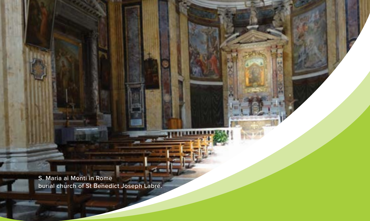
S. Maria ai Monti in Rome burial church of St Benedict Joseph Labré.