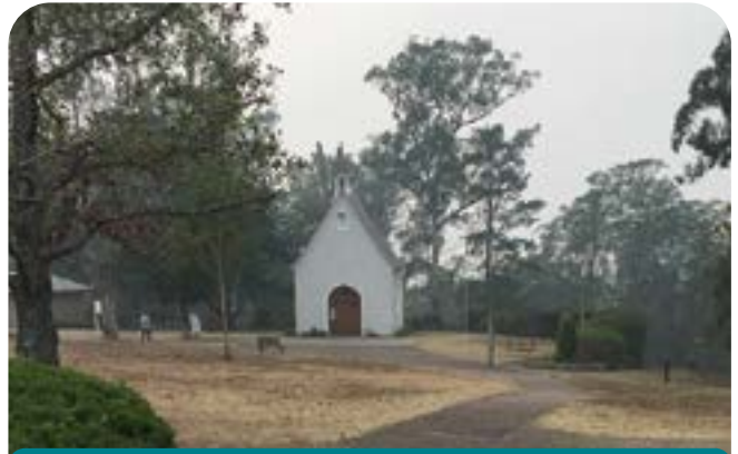
Mt Schoenstatt Shrine.