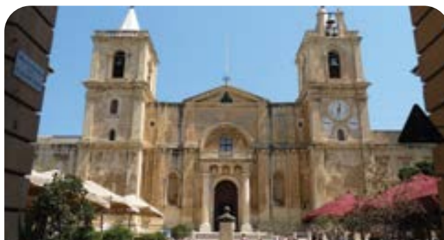
St John's Co-Cathedral, Malta. The main cathedral of the Archdiocese of Malta is The Metropolitan Cathedral of Saint Paul, commonly known as St Paul's Cathedral or the Mdina Cathedral. The cathedral is the seat of the Archdiocese of Malta, and since the 19th century this function has been shared with St John's Co-Cathedral in Valletta.