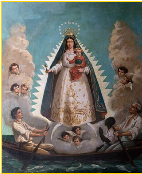
A painting of the Virgin of Charity of El Cobre is seen in a museum of Catholic artifacts and artwork at the cathedral in Santiago, Cuba

slave boy left Santiago del Prado (known today as El Cobre) to fetch salt with which to preserve meat for the copper miners in their district. During their voyage, they found themselves in a storm in the middle of the Bay of Nipe on the Atlantic coast of Cuba. Deciding to anchor for the night and wait for dawn, the brothers observed a 'small white bundle' floating towards them in the early morning. On inspection, they found it to be a 40 cm statue of the Blessed Virgin Mary standing on the moon with clouds on both sides of it and three gold winged cherubs beneath. The Virgin Mother was carrying the infant Jesus on her left arm that had one hand raised in blessing and the other carrying a golden globe. In her right hand, the Virgin Mother was carrying a crucifix – the symbol of humanity's salvation. A wide