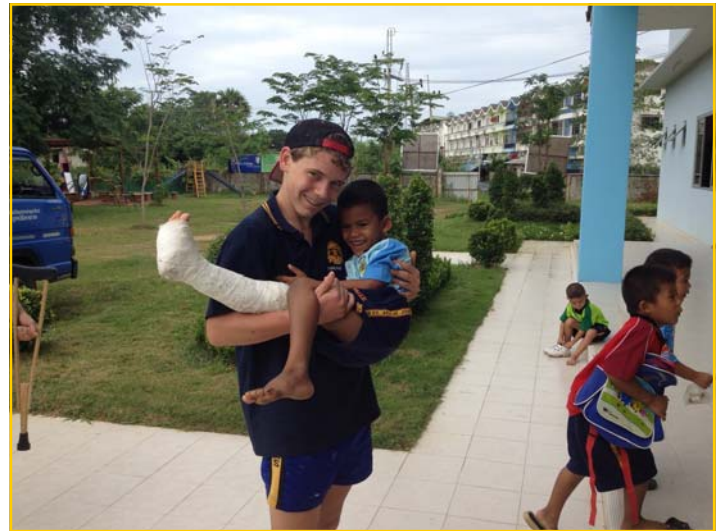
A student volunteer assisting an orphaned child from the kindergarten who had recently broken his leg

Our residence was at La Salle College in the city of Nakhon Sawan. There each of the students were introduced to two or three Thai students who would be their mentors. Being of equivalent age to the students, these mentors accompanied them during their time at Nakhon Sawan, spending much of their