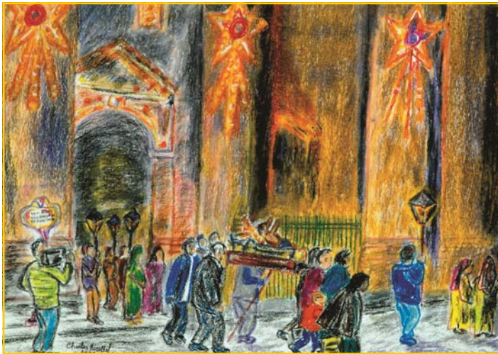
Procession of the Verbum Dei caro factum est