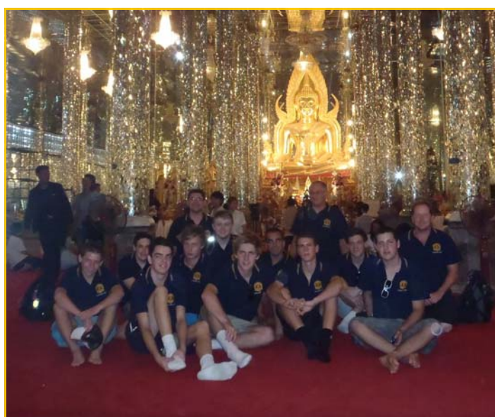
Volunteers at a Buddhist temple