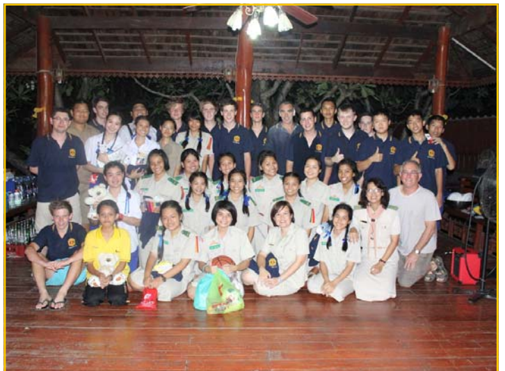
Volunteers and mentors