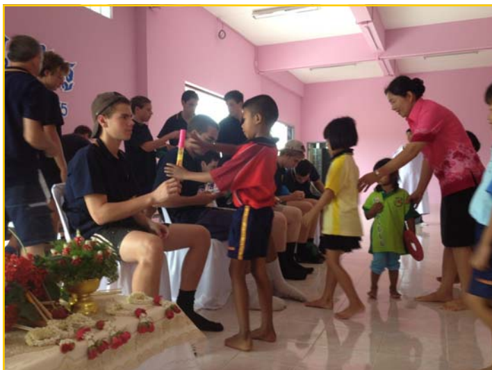
Volunteers distributing gifts to the kindergarten children