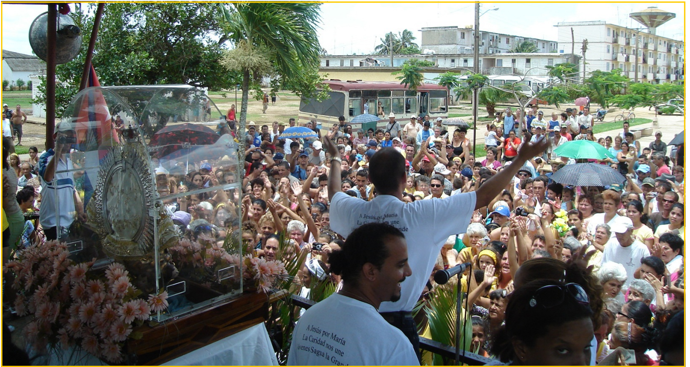
The statue presented to the local church community