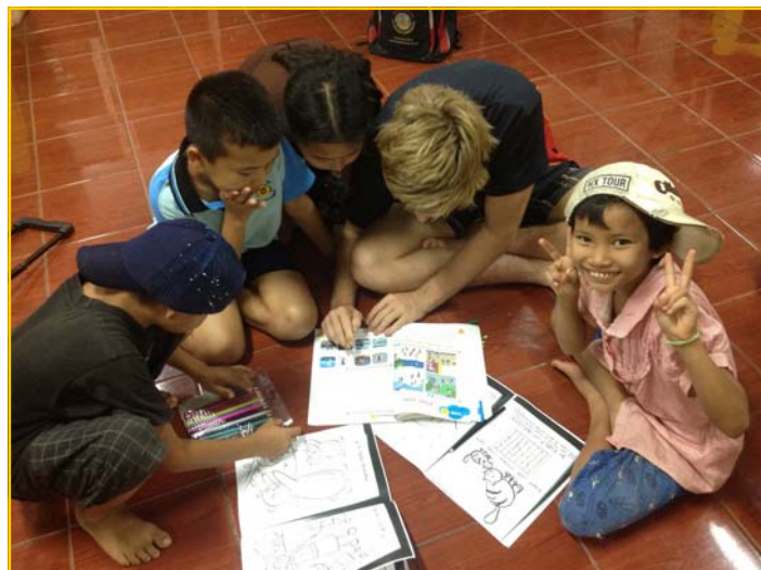
Volunteers assisting the boarders with homework