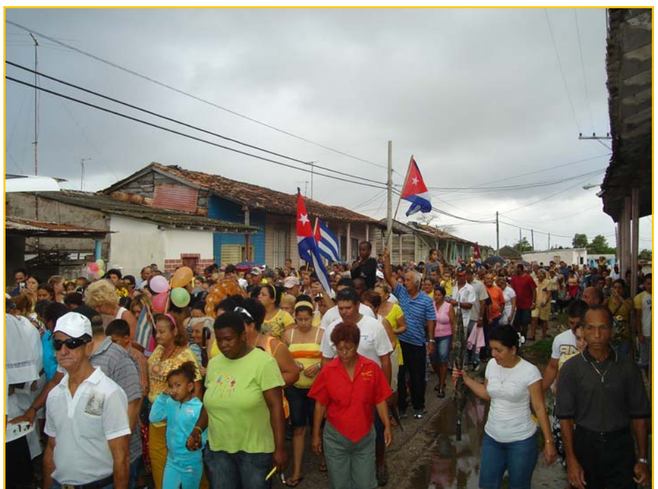
Procession of the statue to the parish church

The 400th anniversary of the discovery of the statue is therefore a very special and monumental event for the Catholic community of Cuba and has been embraced with plenty of enthusiasm. In preparation for the anniversary, the statue throughout 2011 was taken in pilgrimage to every parish on the island. Between 3 and 6 June 2011, the pilgrimage passed through Sagua la Grande. The SDC community there participated both in the preparations for the visit and in welcoming the statue.