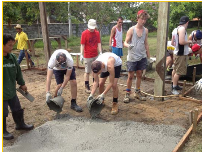
Volunteers pouring the concrete slab of the pavilion

The happiness of the children actually lifted our spirits. Every day, some of the students were invited to take a seat at the back of a truck with the rest of the kindergarten children for their ride home. Nothing could prepare them for the journey that took place.