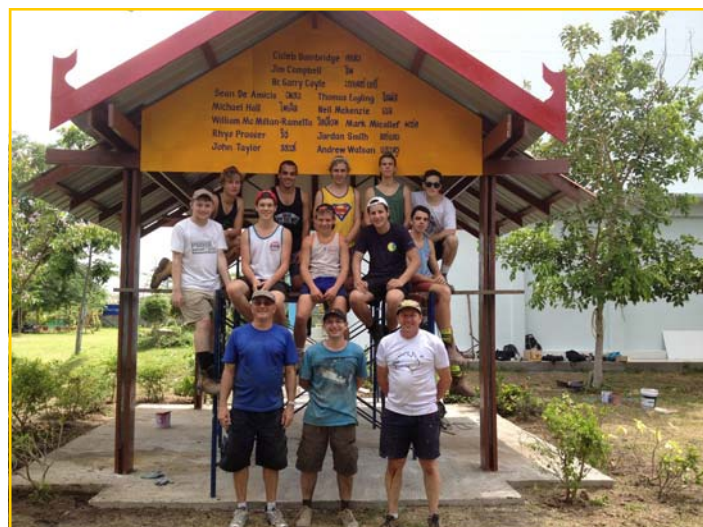
Volunteers and the pavilion

Seeing the devastatingly poor conditions that these children live in and yet manage to keep a smile on their face had a significant impact. I doubt any of the students will forget that eye-opener for a long time.