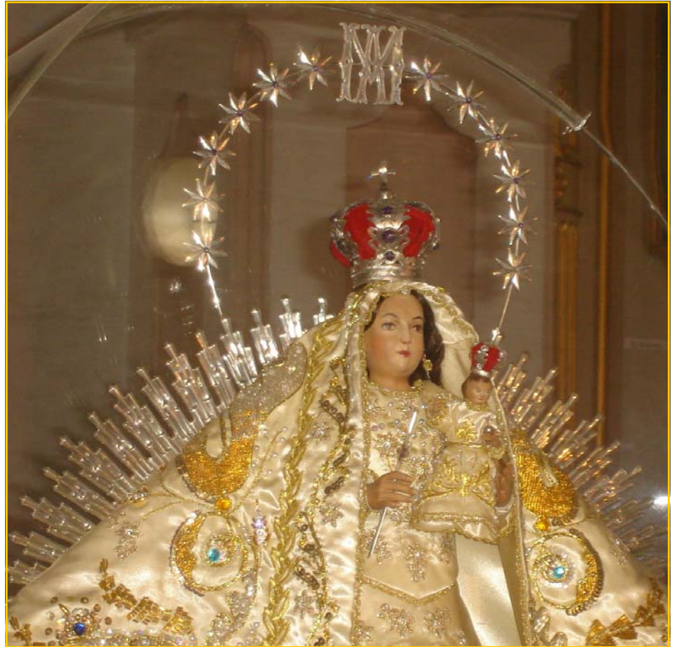
Statue of La Virgen de la Caridad del Cobre

Understandably, much of the focus for the Members ministering in this new mission has been to breathe in the new air, adapting to new circumstances and inculturation while simultaneously wrestling with the challenges to establish and progress programmes to make the Gospel known. In the eighteen months since their