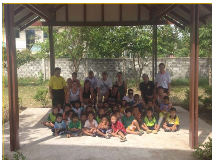
Volunteers and children under the pavilion