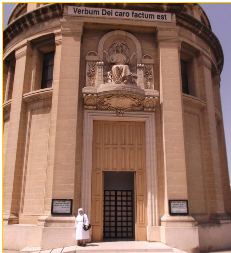
Pictured outside the SDC Central House chapel

Jeanne Jugan is the Foundress of the first Little Sister of the Poor and was canonised by Pope Benedict XVI on 11 October 2009. The Sisters have a vowed life with the additional vow of 'hospitality'. The vow of hospitality perfects the gift of them to God and brings their religious consecration into the realities of everyday life. It gives a spiritual value to the many humble acts of service performed throughout the day, and enables them to communicate to the elderly