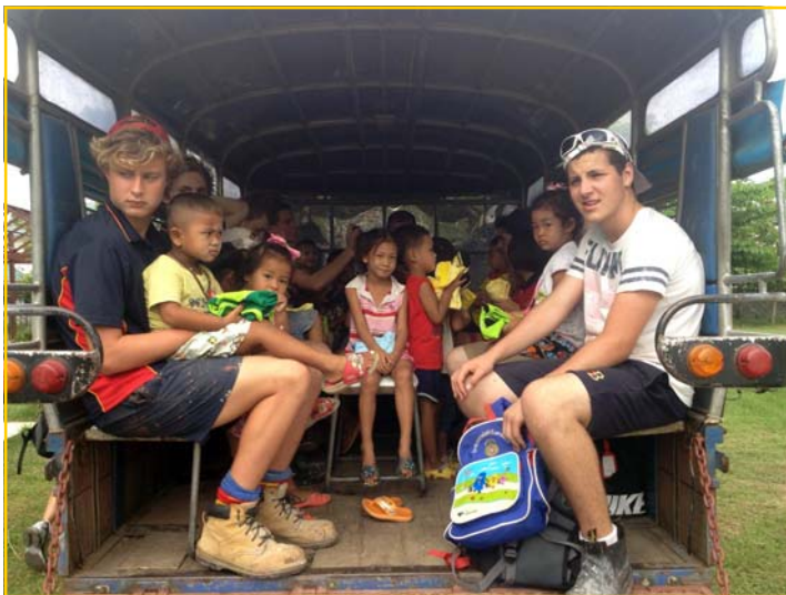
Volunteers riding home with the kindergarten children

personal time sharing their college, city and culture. Each afternoon after the students returned from the kindergarten, the mentors would be waiting to socialise with them and partake in various sporting events together. The students were astounded by the selfless generosity of the mentors who did so much to make them feel right at home. This included providing them with gifts, food, a farewell party and their free time on the weekends. As a result, friendships flourished between the mentors and the students. Goodbyes became very difficult at the conclusion of the programme.